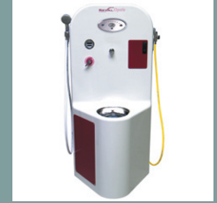
3012.01 Shower & sluice system