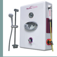
3011.01 Shower system